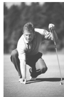
Some Southern hospitality is needed to welcome PGA players during their visit to our community.