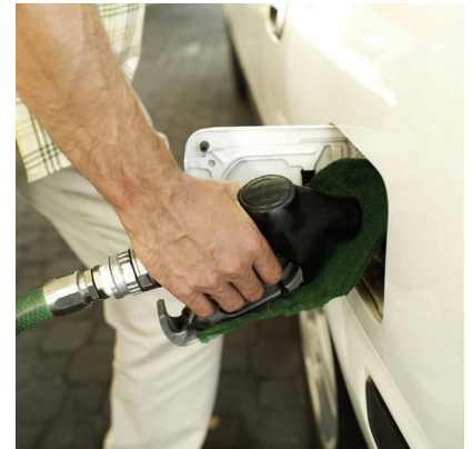
Prices at the pump affect availability of volunteers.

Changes are being proposed in Congress to increase the value of the deduction for volunteer travel from 14 cents to the same rate as medical. This increase would only be helpful to volunteers who itemize on their tax returns.