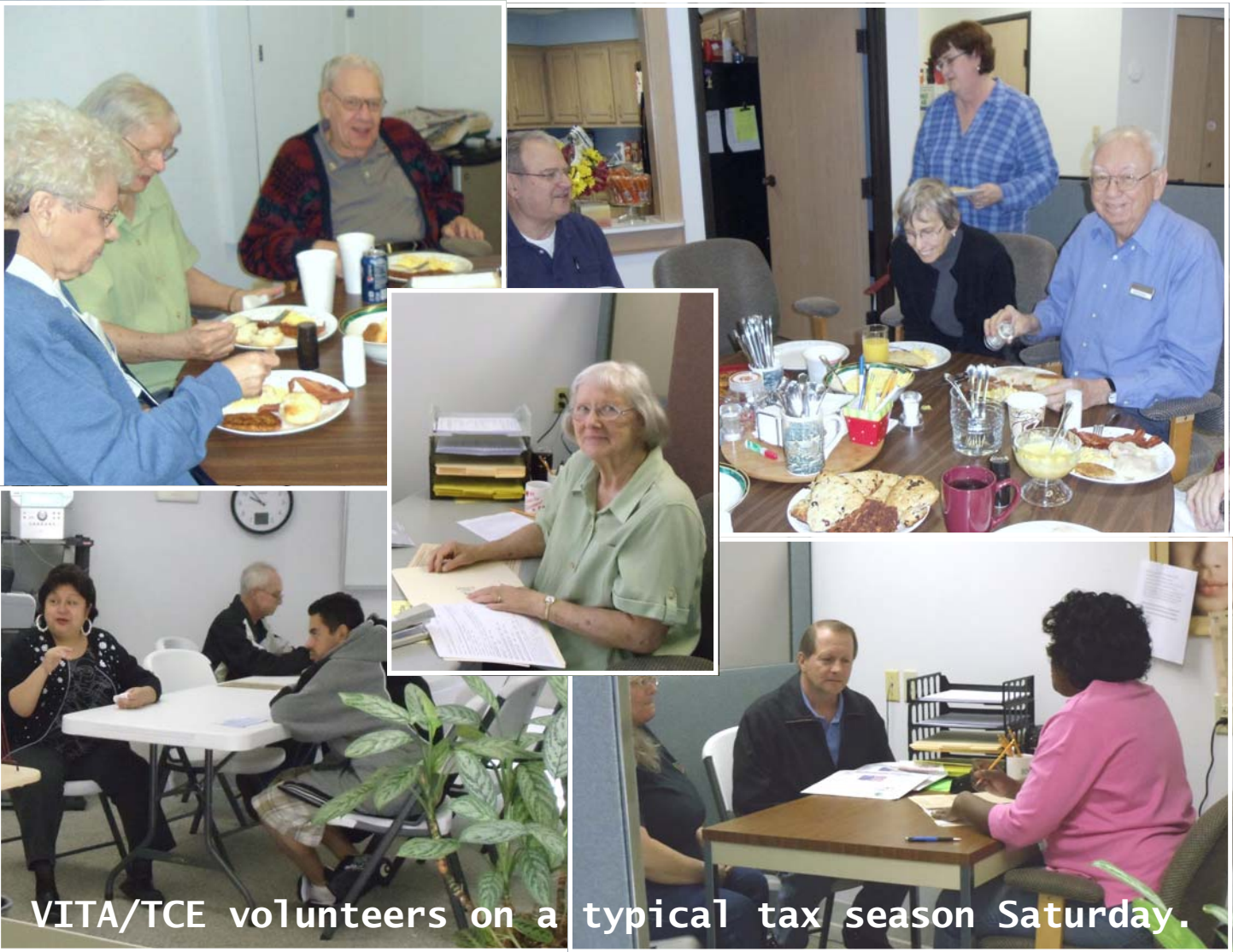
VITA/TCE volunteers on a typical tax season Saturday.