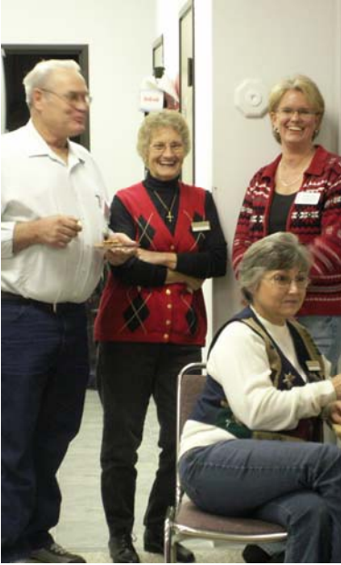
Holiday Open House December 3rd & 4th RSVP Center