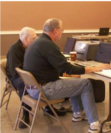
Earned Income Clinic Jan. 30th & 31st Elm Grove Community Center